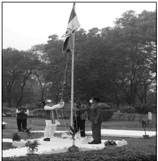
সিএসআইআর-সিএমইআরআই-এর উদ্যোগে ৭০তম প্রজাতন্ত্র দিবস পালিত হইবে।

কলকাতা, ২৭ জানুয়ারি: পূর্ব ভারতের উত্তর-পূর্ব অঞ্চলে হোভা গ্রাঞ্জিয়া ১২৫ পূর্বাঞ্চলে ২ লাখ গ্রাহকের মাইলফলক অর্জন করেছে।