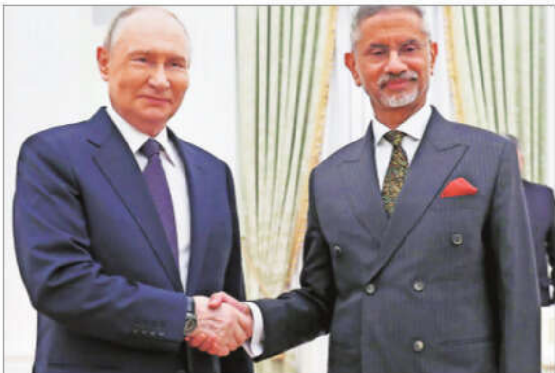
External Affairs Minister S Jaishankar with Russian President Vladimir Putin during their meeting at the Senate Palace of the Kremlin in Moscow, on Tuesday

"It is imperative that the world displays zero tolerance towards terrorism in all its forms and manifestations. There can be no justification, no looking away and no whitewashing," the EAM said.